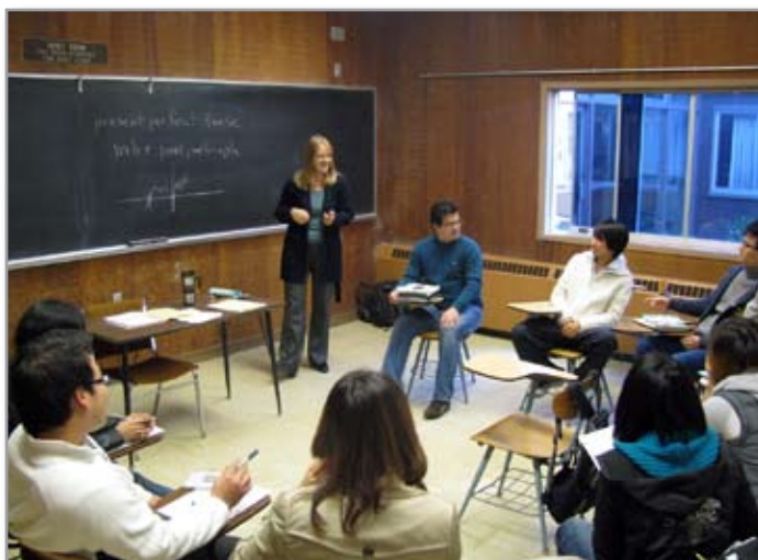
Chabot College will waive the TOEFL® for ELS 109 graduates. Credits earned in a Chabot College 2-year degree program may be transferred to most 4-year colleges and universities.