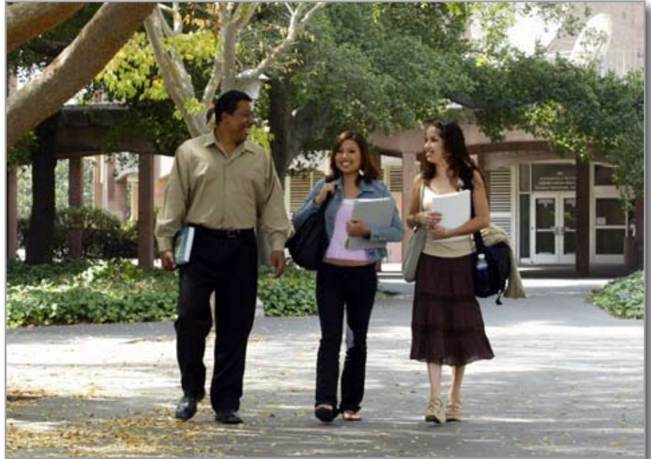
Fast Track was created to make it possible for motivated students with Intermediate to Advanced levels to complete the required English proficiency to meet college admission requirements in time for Fall and/or Spring semester matriculation.

ELS Language Centers offers 12 levels of instruction (levels 101-112). Due to its high intensity, Fast Track is designed for Intermediate to Advanced learners (levels 104 and above). Students with Beginning English skills (levels 101-103) will need to first complete a Foundation Series (with 6 hours of instruction per day) prior to entering the Fast Track program. The Foundation Series consists of four, 3-week sessions (12 weeks total), although students may not be required to take all 4 sessions.