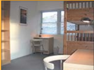
Large bedrooms with pictures and modern furniture