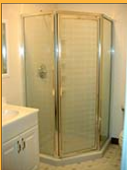
Our daily cleaning service keeps all bathrooms clean.