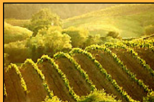
The famous Napa Valley wine region is only 30 minutes away.