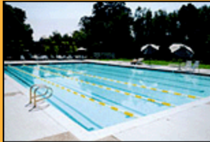
Dominican's recreation center is open to all ELS students.