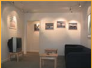
In the Living Room, students enjoy watching movies from our large DVD collection.