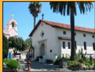
The historic mission of San Rafael is only one of many sight-seeing opportunities.