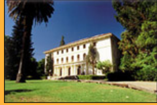
The beautiful campus of Dominican University.

179 Los Ranchitos Road, San Rafael, CA 94903