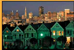
San Francisco can easily be reached by express bus.